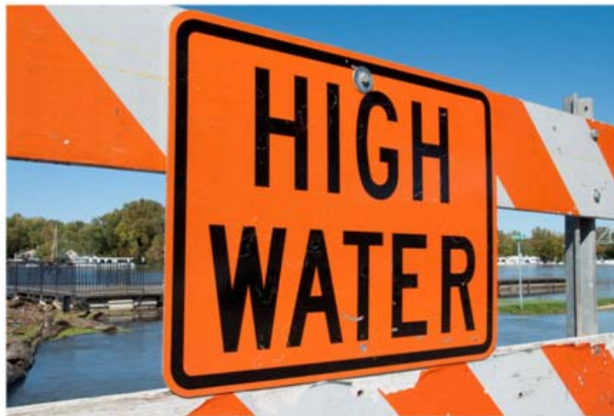
Figure 5 - Road in Red Wing, Minnesota, is closed due to flooding (Source: FEMA Photo Library, 2010)

While not responsible for developing an evacuation plan, levee owners and operators are encouraged to maintain close contact with appropriate government agencies during emergencies to provide timely and accurate information on levee conditions.