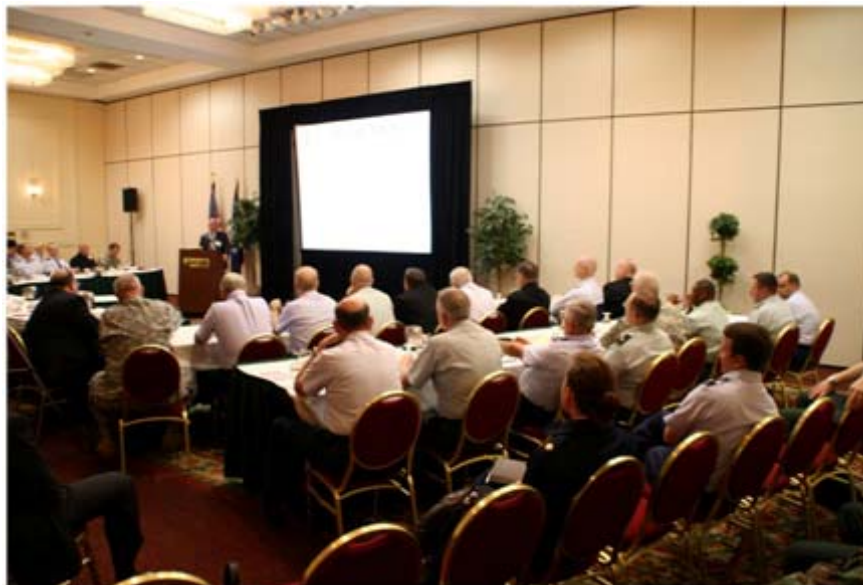
Figure 6 - Government representatives, non-governmental organizations, and private industry partners participating at an exercise in Baton Rouge, Louisiana

Exercise activities may include participation in State and local emergency exercises where levee personnel can interact with multiple public safety agencies. Additional opportunities to identify improvement actions may be found through the review of the levee emergency preparedness plan after an activation triggered by a real-world incident.